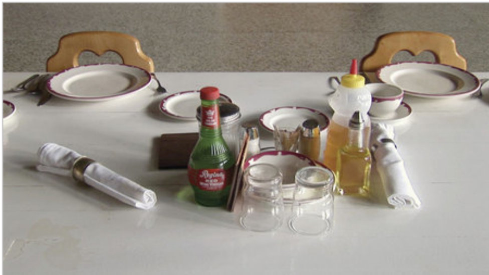
Owen Kydd Table Setting from Mission 2006 Video still

VANCOUVER ART GALLERY OCT 3 2009 TO JAN 3 2010