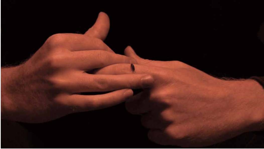
Owen Kydd Hands with Isopod from Night 2007 Video still

This article was first published online on November 12, 2009.